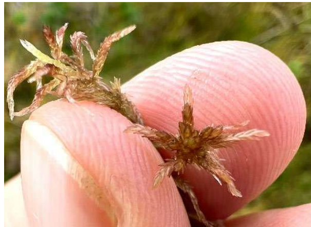
Sphagnum venustum , at the top together with S. papillosum and S. rubellum , at Henningvatnet.